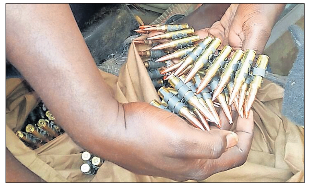
CONFISCATED: Some of the ammunition confiscated from a member of SANDF.